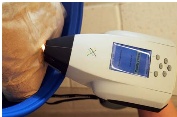
Figure 4. Handheld instrumentation can be brought to the material being identified. Plastic liners do not need to be opened for analysis.

In many cases, identification can be performed without opening the bag containing the raw material. Handheld instrumentation has significant advantages for the identification process when the material must be kept dry, aseptic, or is received in large, difficult to move containers. Using near-infrared, the verification process can include determination of moisture content. Unusually high or low moisture content can affect cost per weight, performance in extrusion and storage of raw materials. Verification of identity at the receiving dock can eliminate the need for a quarantine queue for receiving material.