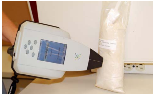
Figure 2. PHAZIR™ in use

If a customer has specific needs, the QA/QC engineer can build the calibration equations, install the equations, test the PHAZIR and bring it to production technicians for use. The instrument is software customizable; the same tool can be used for many different applications. PHAZIR-MG™ is a Microsoft Windows application designed for rapid building of both qualitative and quantitative equations for the PHAZIR™. The software incorporates the functions needed for identification and quantitative results.